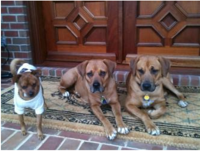
Monkey and Cletis (left photo) lost their former home to a fire. Now they are truly living the good life on 3 acres in Northern Virginia.