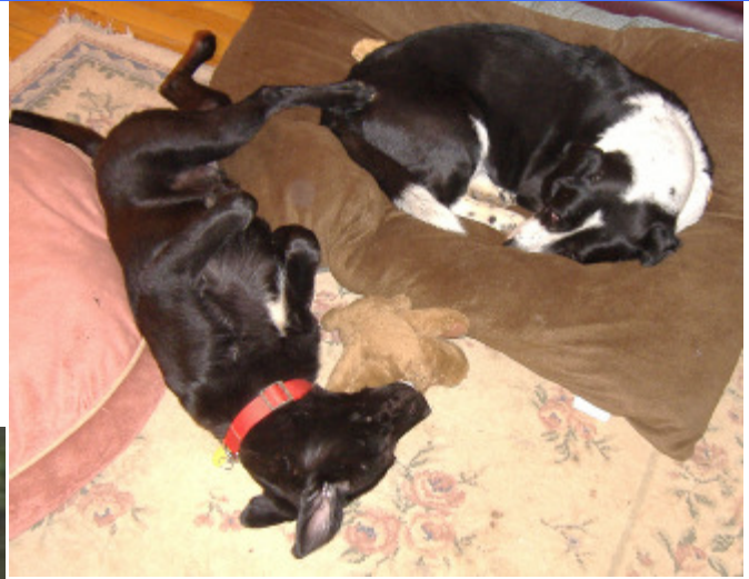
I adopted Princeton (above photo) in February of this year. We renamed him Tank! Because he was heavy as a tank!

We love him to pieces and he is best friends with our Border Collie Maggie. He has lots of toys and loves to play in the yard. He's potty trained, knows how to sit and give a "high five." He looks like a small lab, with not much rott showing through.