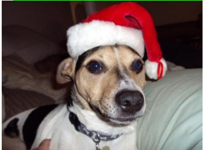
Here is a new photo of Romeo . His Mom was Eve and we rescued her from a South Carolina pound.